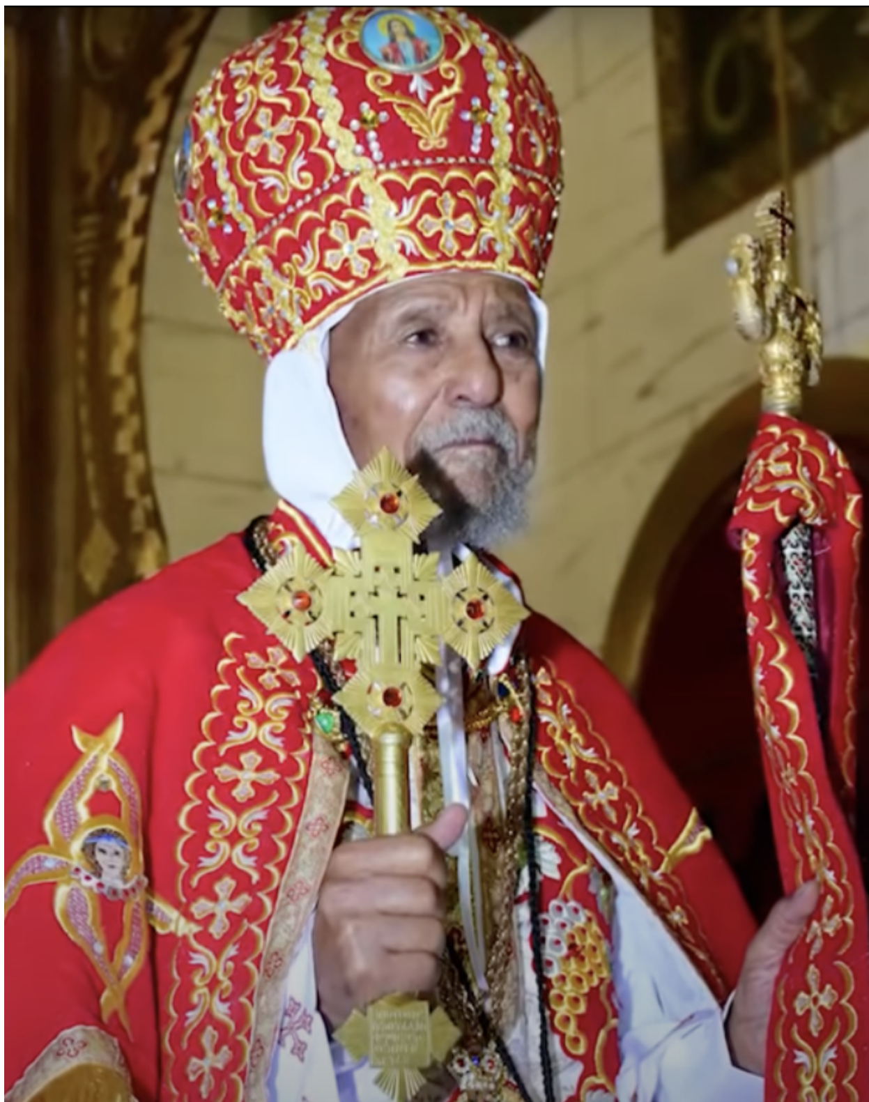
H.H Pope Qierlos I the 5 th Patriarch of Eritrea